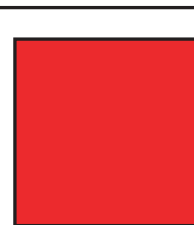
PMS 186 C